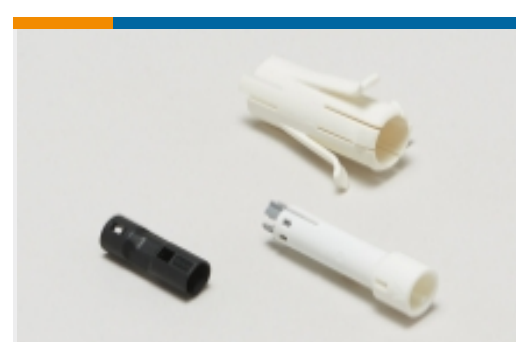
Plug & Socket Lighting Connector Accessories(57)